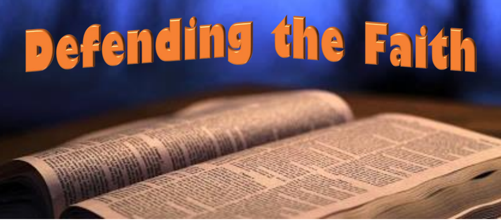
Newsletter by Helen Kamenos © All rights reserved